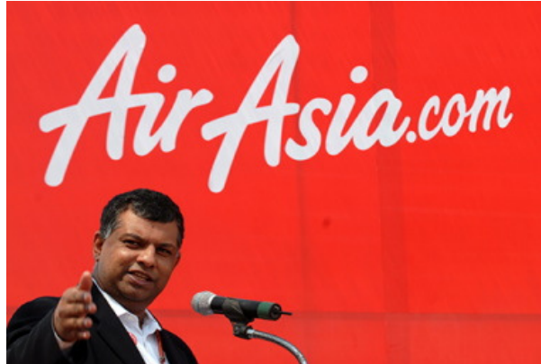
Dato' Sri Tony Fernandes, AirAsia CEO

AirAsia, the world's best low cost airline, officially celebrates its newest international route from Penang to Singapore today. The route opened for sale on 27 April 2009 with free seats offered to the public, and today marks the inaugural flight from the 'Pearl of the Orient' that was recently named a World Heritage Site by UNESCO, to the 'Lion City'.